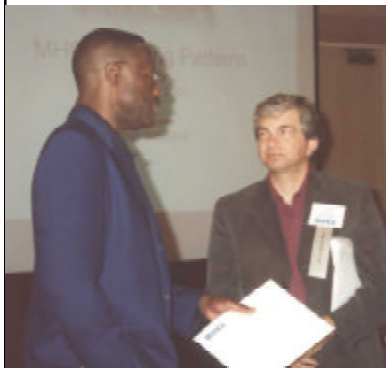
Panelists for Clinical Staffing Patterns Report: