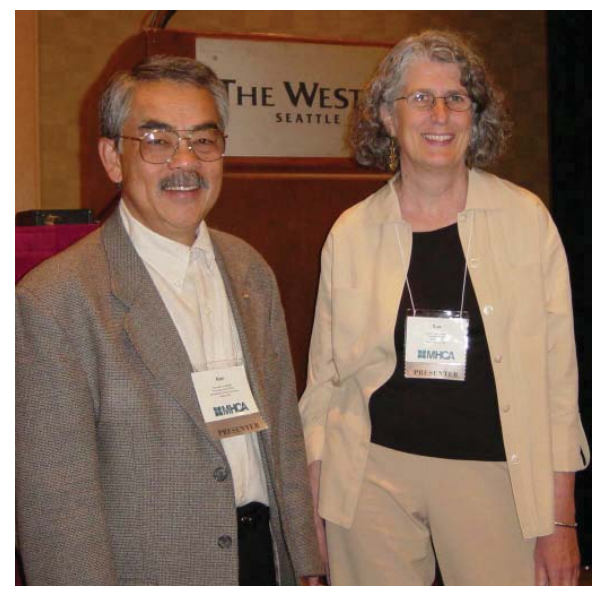
Third Quarter 2006